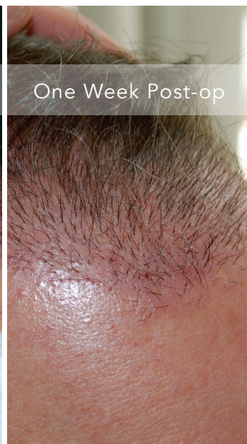
One Week Post-op