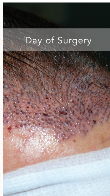
Day of Surgery